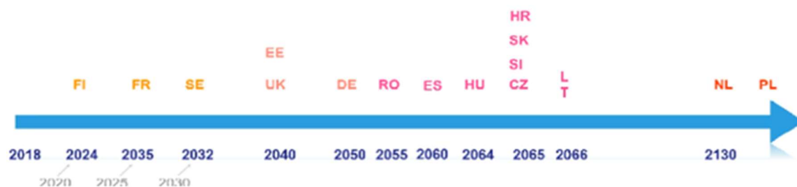
Figure 2: Planned start of operation of deep geological repositories in EU member states (EC Report 2019, p. 9)

In the EC Report 2019, the timeline for the planned operation start of national DGRs was presented.